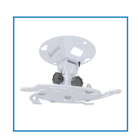
Only 143 mm distance from mounting surface